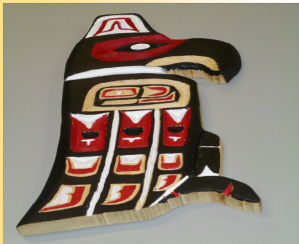
Westshore First Nation Grad Artwork

Visit the District Resource Centre for numerous Aboriginal titles to use for the classroom teaching